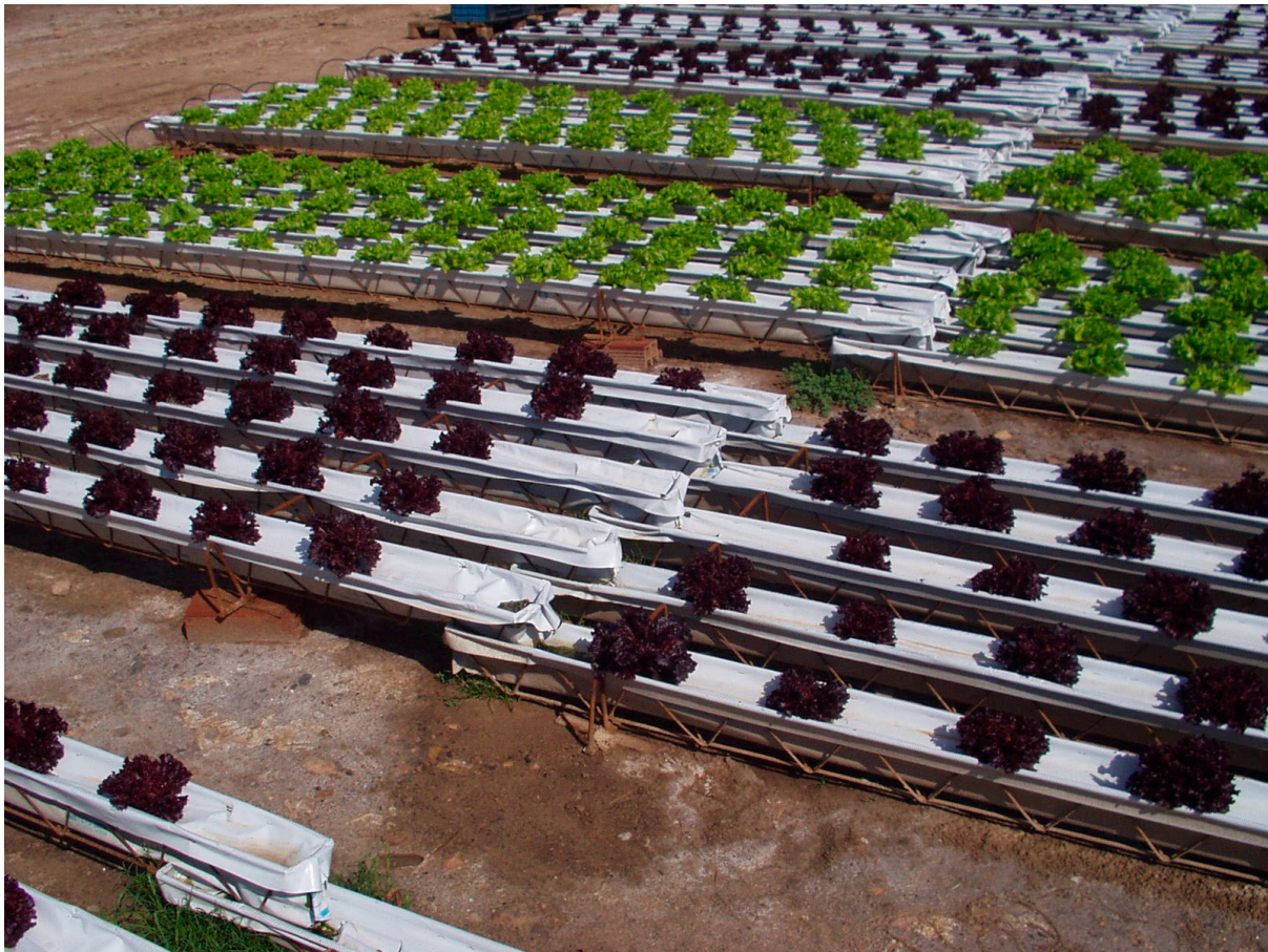
Figure 3. Nutrient film techniques (NFT), a type of soilless systems where a thin film of nutrient solution flows through plastic channels which contain the plant roots and laid on a slope in order to grant the constant flow of nutrient solution.

Soilless systems, such as hydroponic floating systems [71] or nutrient film techniques (NFT) [72], are being used for leafy vegetables with short production cycles allowing a better control and standardization of the cultivation process (Figure 3). Many advantages have been attributed to the use of soilless systems in greenhouses to produce leafy greens, but reductions in product quality and shelf life have been observed [73] which may limit the use of these systems. However, recent studies carried out in commercial agricultural production sites showed that the use of poor quality irrigation water combined with the use of soilless production systems considerably reduced microbial contamination risks to fresh produce [42,74].