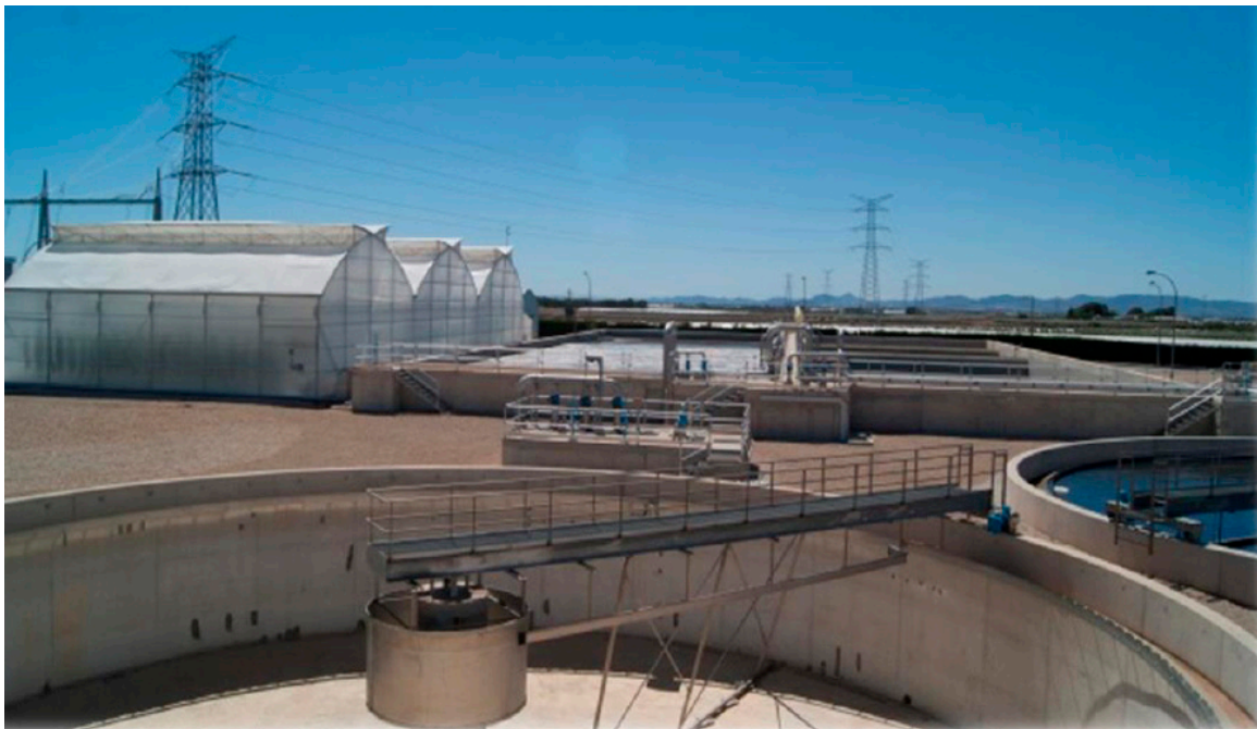
Figure 1. A secondary treatment wastewater plant located in a greenhouse production unit to provide irrigation water for tomato production.

Studies focusing on the microbial quality of reclaimed water used for irrigation reported presence of faecal contamination within the range 2–4 log E. coli cfu/100 mL and also presence of pathogenic microorganisms such as Salmonella spp. [41,42] (Table 1). Production systems that minimize irrigation water contact with the edible portion of the crop seem to reduce the risk of contamination. Codex Alimentarius [43] reported that plants grown in hydroponic systems absorb nutrients and water at varying rates, constantly changing the composition of the re-circulated nutrient solution and because