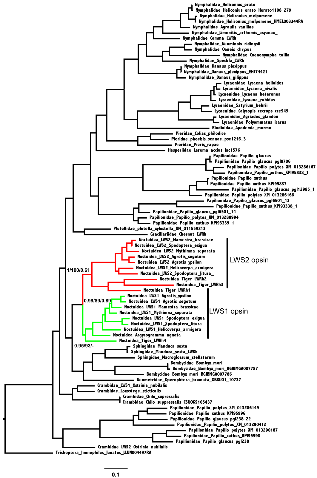
Fig. 1 Maximum likelihood under GTR-G. Support values at nodes are from left to right aBayes, Ultrafast bootstrap and Bayesian Posterior Probability. LWS2 opsins of noctuid species denoted in red color. Noctuidae LWS1 opsins denoted in green color