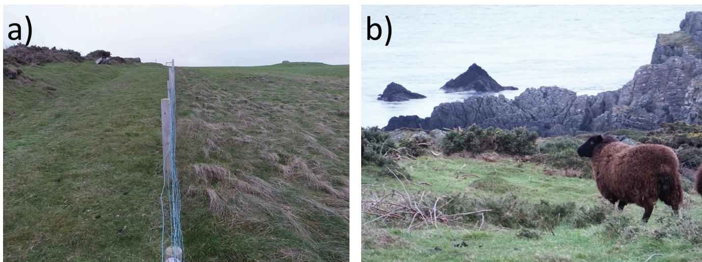
Fig. 3. The impact of targeted grazing in January 2017 after clearance of gorse two years earlier, A. vegetation either side of fencing; B. hardy Welsh Mountain- Texel cross sheep grazing on-site.

at levels insufficient to maintain habitat suitable for S. stigmaticus . A new Management Agreement is being negotiated with the landowner, who wishes to introduce Highland cattle.