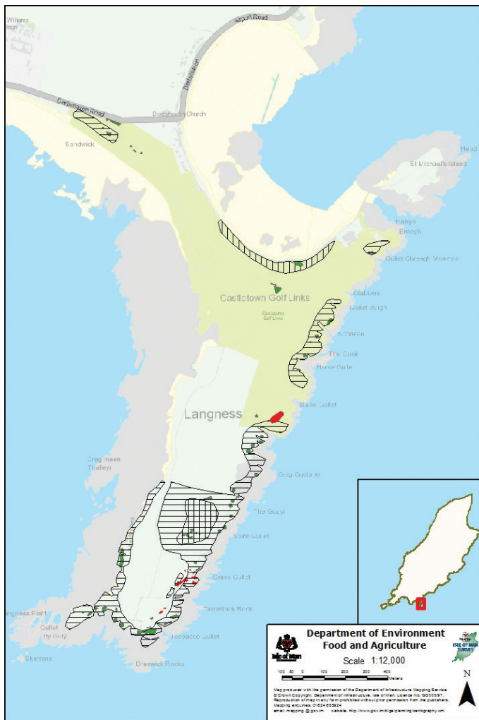
Fig. 2. Aerial photograph of Langness, showing the area covered by the golf course (light green), the distribution of S. stigmaticus in August 1964 (vertical hatching), 1990 (horizontal hatching), and sites occupied from 2002 in the absence of grazing (dark green) and sites occupied from 2002 where grazing had been reintroduced (red) (based on mapping by Mr. J. F. Burton reported in RPS Clouston (1990), Cherrill (1990, 1994) and subsequent observations by the authors).

socky vegetation (up to approximately 15 cm) occupied by Chorithippus brunneus (Thunberg) (Orthoptera: Acrididae: Gomphocerinae) from which M. maculatus is absent. Moreover, while M. maculatus is strictly associated with patches of bare ground, this is not the case for S. stigmaticus , and of the three species, only C. brunneus occurs in the tallest grassland (>15cm). Thus, compared with the two species with which it coexists, S. stigmaticus typically occurs in grass of short to intermediate height, and is often but not exclusively associated with patches of bare ground. A similar situation is reported by Behrens and Fartmann (2004) in Germany. The habitat requirements of S. stigmaticus appear to be linked to the warm, dry conditions needed for egg development, feeding on fine-bladed grasses such as Festuca rubra L., and thermoregulation of nymphs and adults (van Wingerden et al. 1991b, Isern-Vallverdu et al. 1995, van Wingerden and Hereen 1998, Länder 2000).