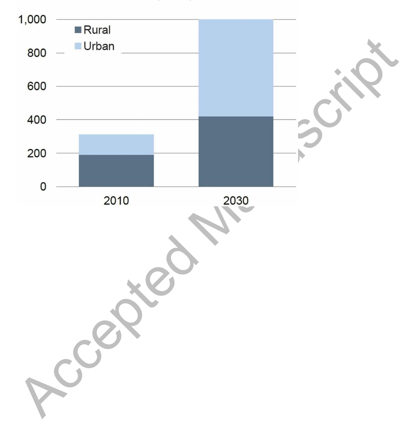
Fig. 4. Food markets to treble by 2030, adapted from Schaffnit-Chatterjee<sup>(100)</sup> Value of SSA food markets, USD, billion