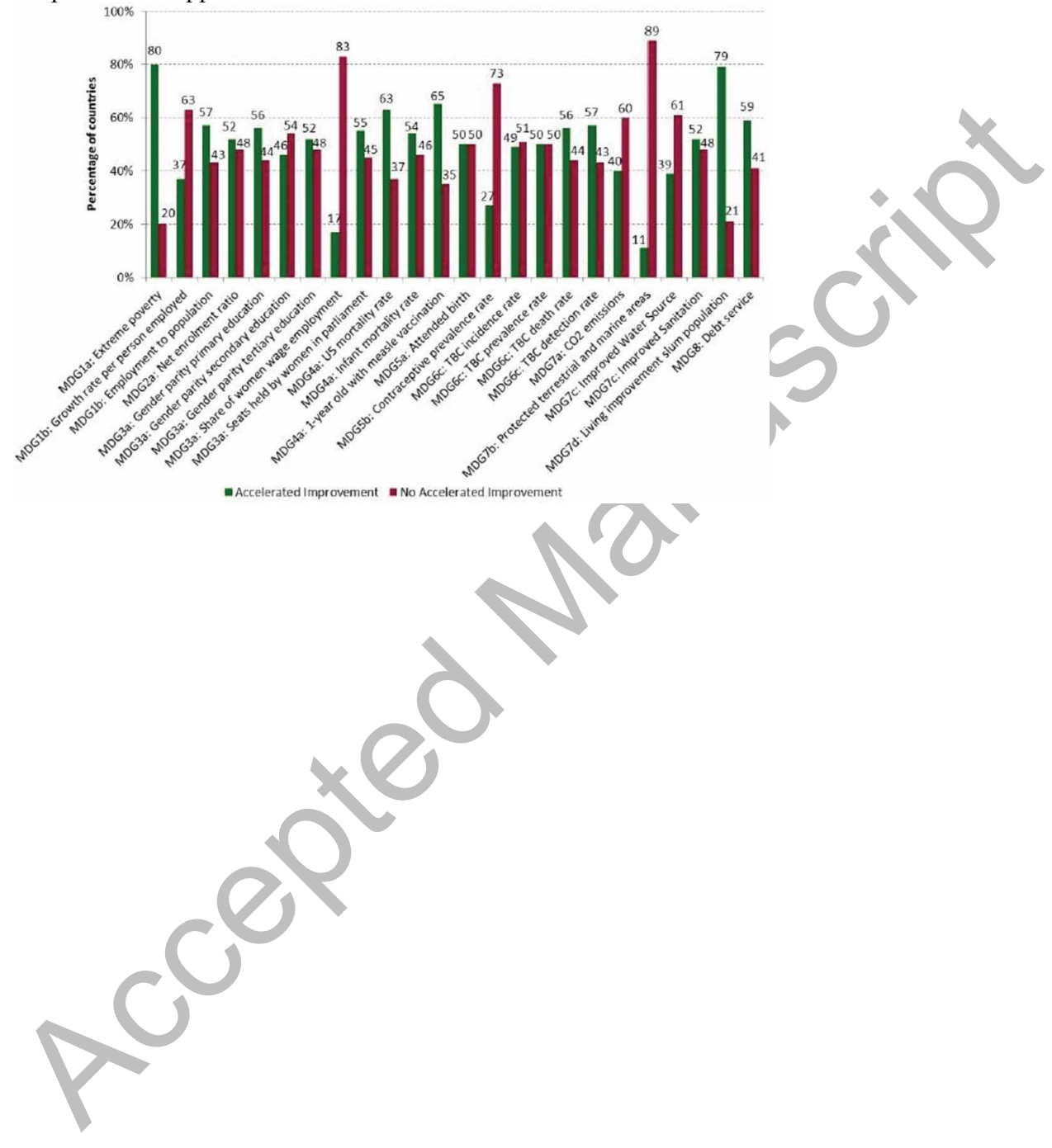
Fig. 2. Percentage of accelerated progress for SSA countries after MDG implementation, adopted from Rippin<sup>(15)</sup>.