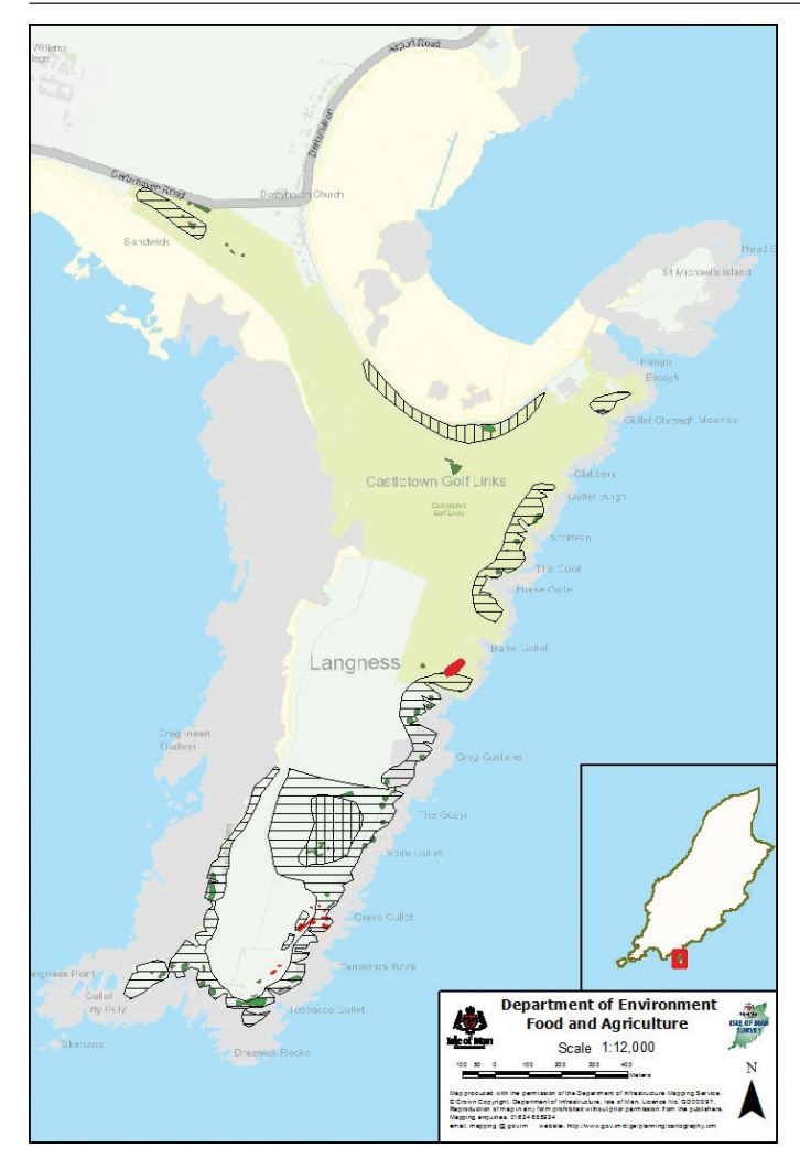
Fig. 2. Aerial photograph of Langness, showing the area covered by the golf course (light green), the distribution of S. stigmaticus in August 1964 (vertical hatching), 1990 (horizontal hatching), and sites occupied from 2002 in the absence of grazing (dark green) and sites occupied from 2002 where grazing had been reintroduced (red) (based on mapping by Mr. J. F. Burton reported in RPS Clouston (1990), Cherrill (1990, 1994) and subsequent observations by the authors).

socky vegetation (up to approximately 15 cm) occupied by Chor thippus brunneus (Thunberg) (Orthoptera: Acrididae: Gomphocerinae) from which M. maculatus is absent. Moreover, while M. maculatus is strictly associated with patches of bare ground, this is not the case for S. stigmaticus , and of the three species, only C. brunneus occurs in the tallest grassland (>15cm). Thus, compared with the two species with which it coexists, S. stigmaticus typically occurs in grass of short to intermediate height, and is often but not exclusively associated with patches of bare ground. A similar situation is reported by Behrens and Fartmann (2004) in Germany. The habitat requirements of S. stigmaticus appear to be linked to the warm, dry conditions needed for egg development, feeding on fine-bladed grasses such as Festuca rubra L., and thermoregulation of nymphs and adults (van Wingerden et al. 1991b, Isern-Vallverdu et al. 1995, van Wingerden and Hereen 1998, Länder 2000).