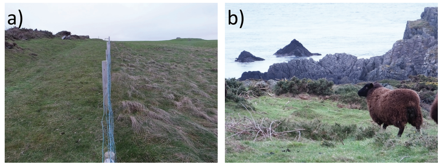
Fig. 3. The impact of targeted grazing in January 2017 after clearance of gorse two years earlier, A. vegetation either side of fencing; B. hardy Welsh Mountain-Texel cross sheep grazing on-site.

at levels insufficient to maintain habitat suitable for S. stigmaticus . A new Management Agreement is being negotiated with the landowner, who wishes to introduce Highland cattle.