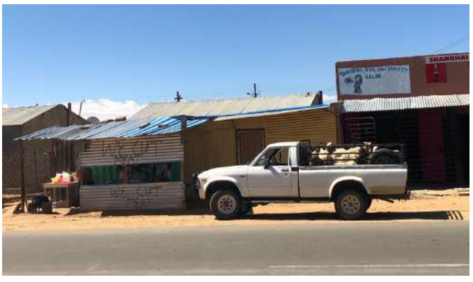
Traditional meat market selling

Outreach, farmer education, and enhanced communication from animal health services are all recognised as key success factors; but without readily available access to veterinarians and services, how may this be achieved?