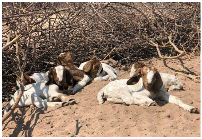
Boar goat production on a commercial farm in the Omaheke Region

Livestock farming is essential to the livelihoods of many rural Africans<sup>1</sup>, with lives immersed in animal production for self-sufficiency, and increasingly robust home and export markets. Pastoralist systems are prevalent in arid regions where inconsistent rainfall prohibits effective crop production, promoting animal farming as a dependable source of income<sup>2</sup>. As 66% of Africa's land expanse is used to graze animals, pastoralism is a vital part of the African economy. Animals also fulfil a spiritual and cultural role in rural populations through ritualised practices which enhance self-knowledge and identity. Livestock production contributes to almost half of the global agricultural gross domestic product (GDP)<sup>3</sup>, yet poverty in the Sub-Saharan African farmer community is widespread and persistent.