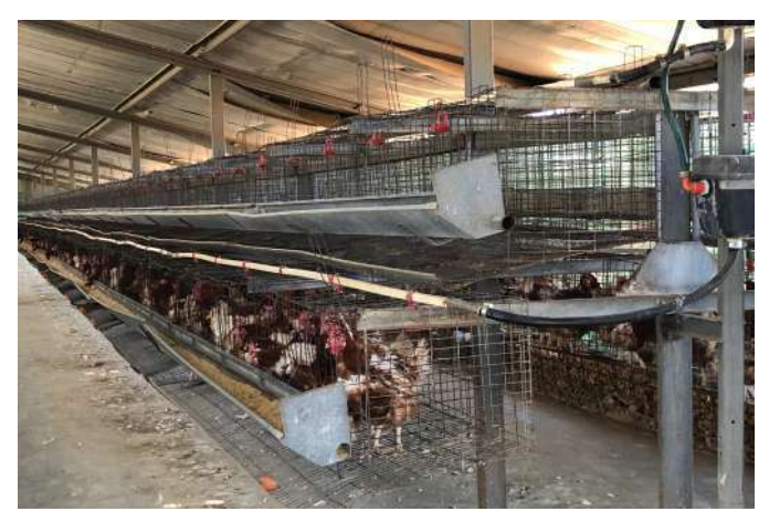
Poultry unit on the outskirts of Windhoek

In some regions, the international meat export markets have surged, with growing demand from the EU and Norway for meat products from Botswana, Namibia, Swaziland, and South Africa. After almost twenty years of lobbying and successful introduction of strict biosecurity measures, in 2020, the Namibian state-owned Meat Corporation of Namibia (MeatCo) entered the American meat market, with an initial shipment of 25 tonnes of beef to Philadelphia. The approval will enable MeatCo to deliver 860 tonnes in the first trading year,