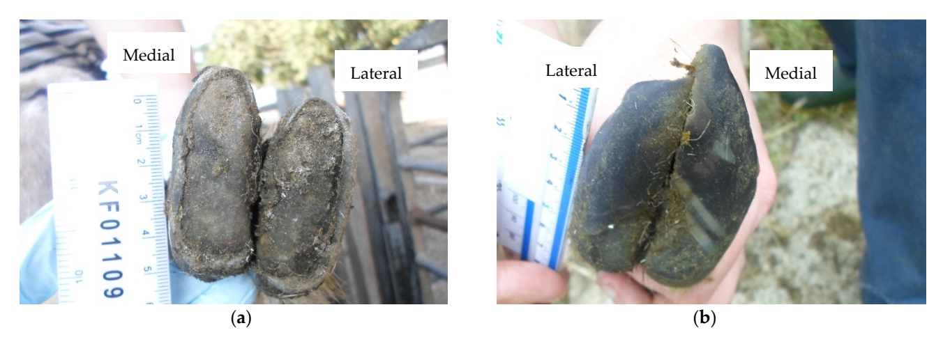
Figure 3. (a) Front foot with no hoof wall overgrowth present (Foot-level score for hoof wall overgrowth = 0); (b) Back foot with severely overgrown wall covering \geq 75% of the sole of both claws (Foot-level score for hoof wall overgrowth = 6).

Farm-level data were obtained from retrospective management practice questionnaires completed by each farmer. Data included farm soil type and flock footrot vaccination (Footvax®, MSD Animal Health, Merck & Co., Kenilworth, NJ, USA) status, in addition to estimates of pasture moisture, quality, type and sward height for each calendar month between August 2019 and September 2020. Meteorological data (average rainfall and temperature for each calendar month) were extracted from publicly available local UK MET Office station archives, as described in [23].