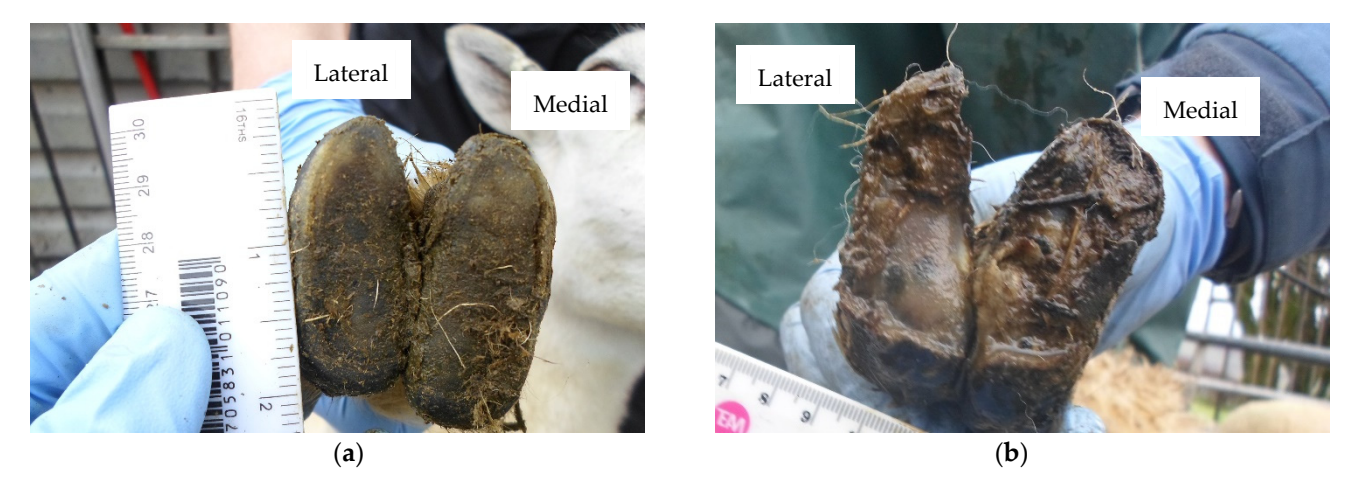
Figure 1. (a) Front foot with an undamaged sole and heel area and perfect shape (Foot-level score for sole and heel conformation = 0); (b) Front foot with a severely damaged sole and heel area of the medial claw (Foot-level score for sole and heel conformation = 3).