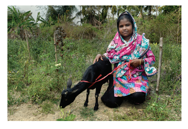
Figure 4. Smallholder farmer participant in Welthungerhilfe sustainable farming and nutrition security program in Bangladesh (Photo: Jens Grossmann, Welthungerhilfe).

Pastoral systems are typically located in more isolated regions either in arid dry areas or mountainous regions in which grazing is seasonal and not possible in the colder winter months. More than 120 million pastoralists worldwide were identified in 2006 (Rass, 2006) with 50 million in sub-Saharan Africa, 31 million in West Asia and North Africa, 25 million in Central Asia, 10 million in South Asia, and 5 million in Central and South America. Importantly they utilize a quarter of the earth's surface area. Their success relates closely to their mobility to ensure their grazing herds are able to utilize the highest quality pasture on offer which may also coincide with their movement to terminal markets. These farmers need to cope with conflicts for land and water and a lack of government services leading to poor animal health and zoonotic disease within their families. Given these farmers are operating in fragile environments highly susceptible to climate change, it is important that they are resourced with appropriate extension