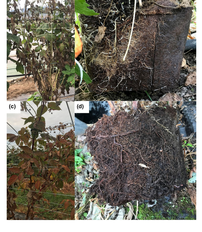
FIGURE 1 Rubus idaeus exhibiting cane wilt, leaf chlorosis and diseased roots consistent with root rot infection: a) and b) show symptoms in plants from which Phytopythium vexans was isolated, c) and d) show symptoms caused by infection with Phytopythium litorale.